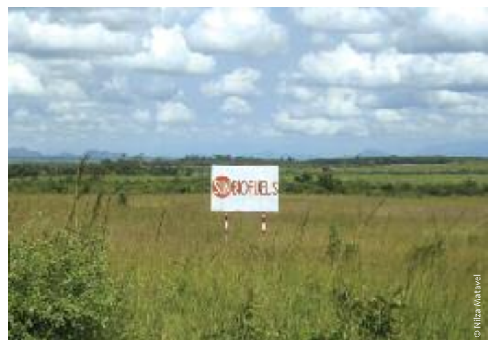
Examples of Jatropha projects in Mozambique. SunBiofuels – Manica.