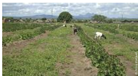
Sun Biofuels – Manica, Mozambique.