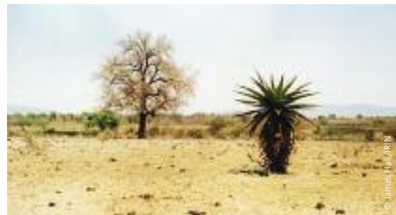
Desertification: former eastern low level crop land, Swaziland.

In Nigeria, plans for large sugar-cane plantations in Gombe State have raised concerns over pesticide use and the impact on surrounding farmland 99 .