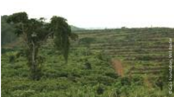
BIDCO palm oil plantation in Kalangala Islands, Lake Victoria, Uganda.

Just as African economies have seen fossil fuels and other natural resources exploited for the benefit of other countries, there is a risk that agrofuels will be exported abroad with minimal benefit for local communities and national economies. Countries will be left with depleted soils, rivers that have been drained and forests that have been destroyed.