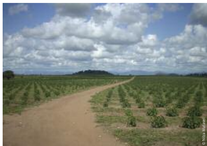
Sun Biofuels jatropha plantation.

Concerns about energy supply appear to be a key driver behind the demand for agrofuel crops - with the EU aiming for 10% of transport fuel to come from “renewable” sources by 2010. These EU targets have established a clear market - which given land prices and the lack of available land within the EU will inevitably be met by imports.