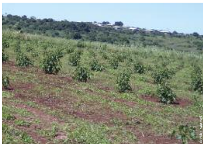
MoçamGalp plantation in Mozambique.

The Intergovernmental Panel on Climate Change has predicted that parts of Africa are likely to become drier, with less reliable rainfall as a result of climate change. The area of African land classified as “dry” could increase by up to 90 million ha. The lack of water will affect crop yields and make livestock farming impossible in some areas 109 .