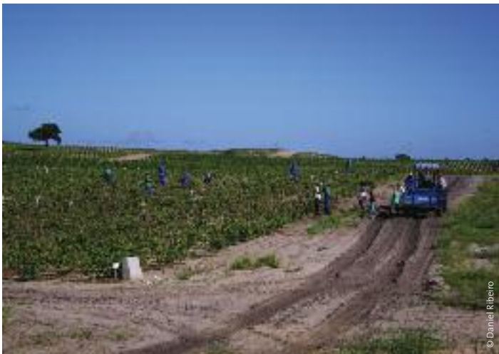
Energem laborers, Dzeve community, Bilene District in Mozambique.

In some cases, foreign companies are reported to be abusing local laws intended to protect workers rights. Sun Biofuels, also in Mozambique, employs 430 workers on jatropha plantations, with workers reportedly employed to work a 45 hour week, with longer days than the law permits 86 .