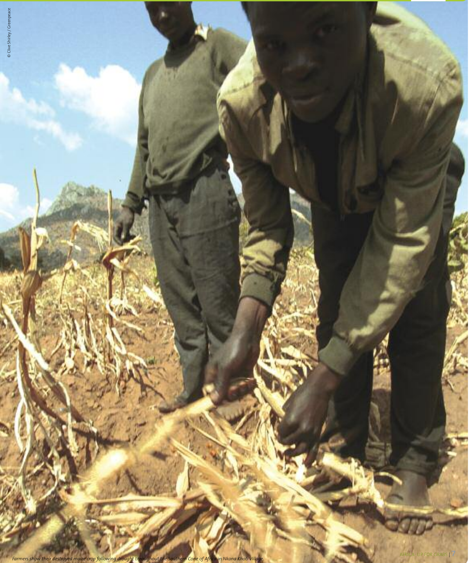
Farmers show their destroyed maize crop following drought throughout the Southern Cone of Africa in Nkana Khoti Village.