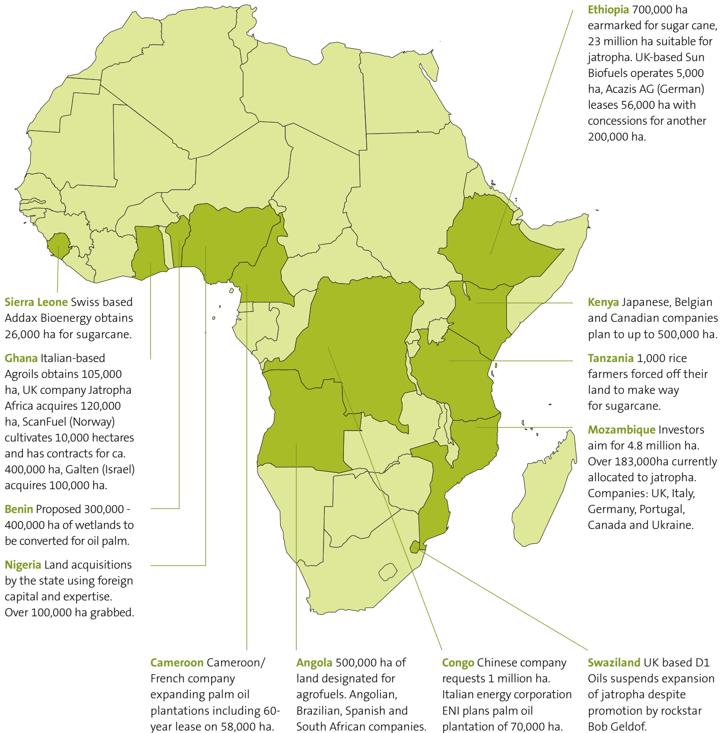
Figure 1. Reported cases of land grabbing and agrofuel developments across Africa