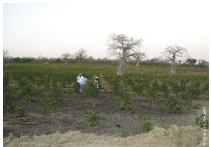
Bioshape jatropha farm in Kilwa, Tanzania.

Even more key is the availability of fertile land with available water supplies. Although there are claims that agrofuel crops such as jatropha and sweet sorghum grow well on marginal land, many of the “land grabs” for agrofuel crops involve land previously used for agriculture.