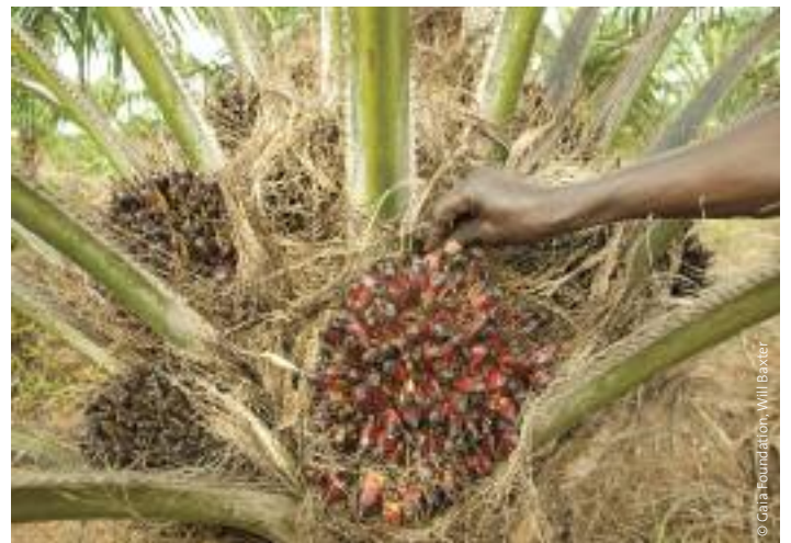
Palm oil fruit.