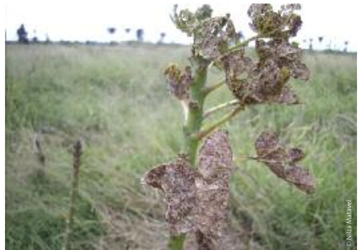
Jatropha with pests, Moamba district in Mozambique.

Farmers from the União Nacional de Camponeses (UNAC) in Mozambique who have been growing jatropha report slow growth rates, low yields and problems with pests 89 .