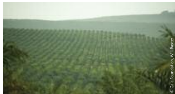
Palm oil plantations in Kalangala Islands, Lake Victoria, Uganda

In doing so, it draws on a number of studies, press reports and local research. There is however a lack of detailed public information about land deals and ownership in most parts of Africa and providing a full picture of the situation is close to impossible. The political situation in a number of Africa countries also makes it very difficult for civil society and members of the public to obtain official information or to speak openly. This report is therefore only a snapshot based on what information is publicly available. Increased transparency and more research are urgently required.