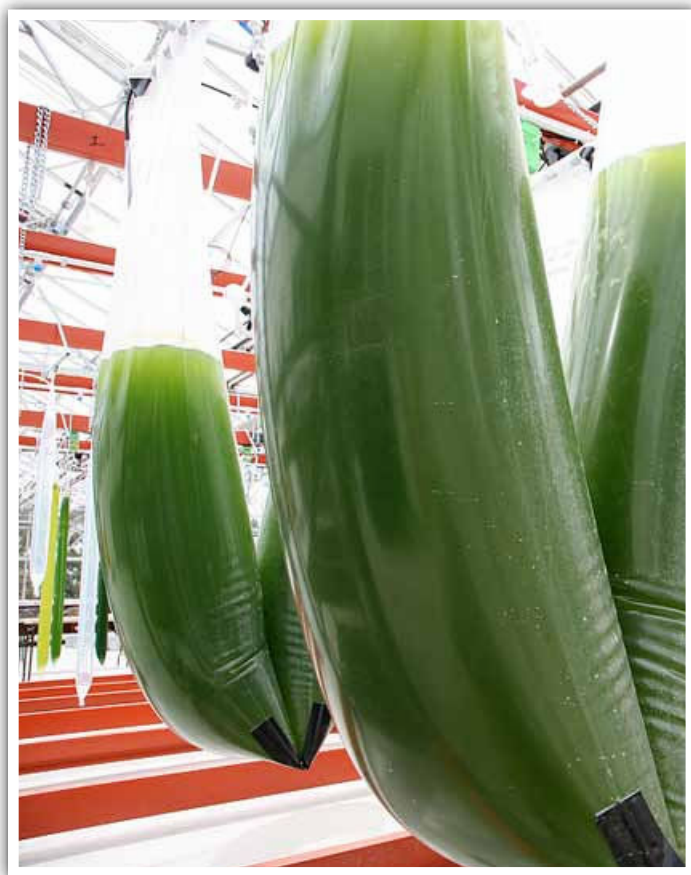
Synthetic algae growing in a greenhouse.

Strict standards that prohibit conflicts of interest should be maintained in the oversight of synthetic biology research, including but not limited to prohibiting persons with financial interests in synthetic biology research, development and commercialization from roles in its health and safety oversight.