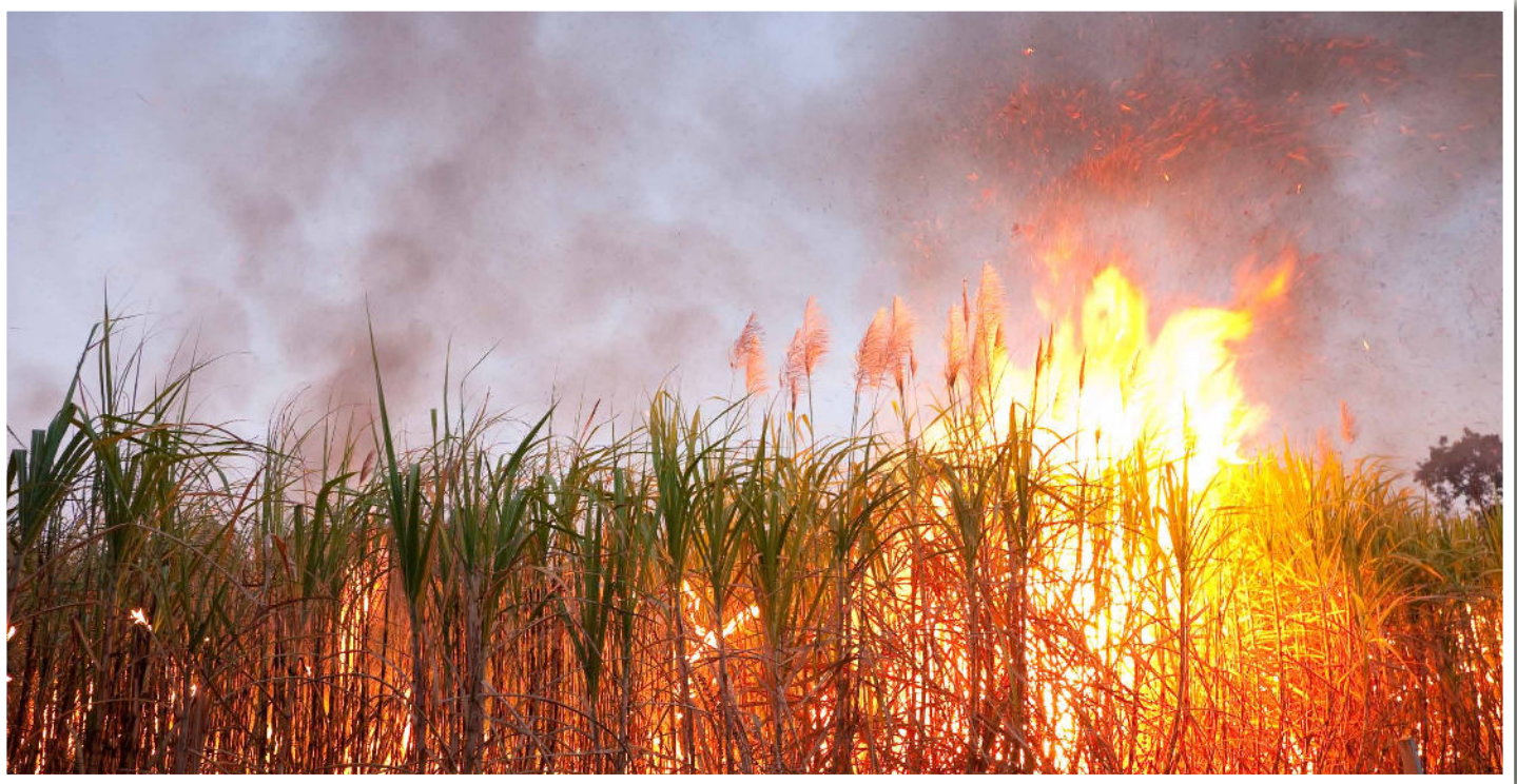
Synthetic biology products depend upon fermenting large quantities of sugarcane. The production and harvesting, including burning, of cane fields releases large amounts of carbon dioxide and causes other environmental and social harms.

Until the above principles are incorporated into international, federal and local law as well as research and industry practices, there must be a moratorium on the release and commercial use of synthetic organisms.