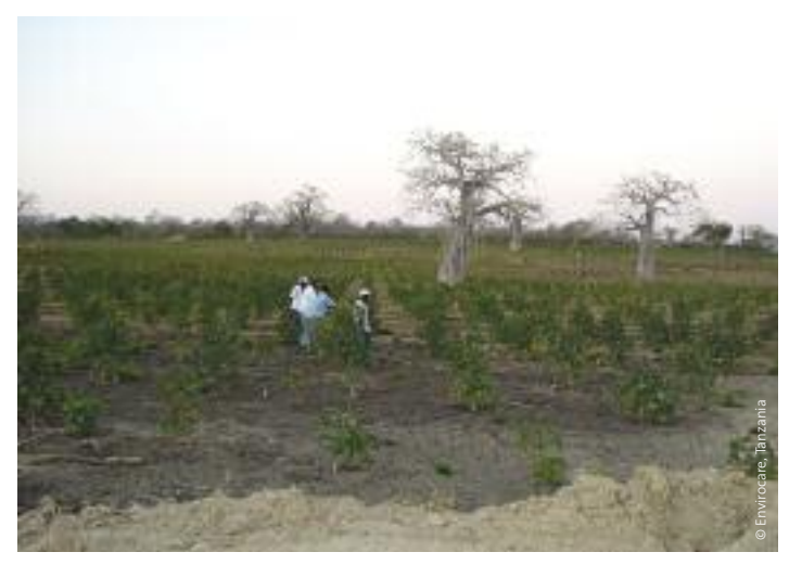
Bioshape jatropha farm in Kilwa, Tanzania.

Even more key is the availability of fertile land with available water supplies. Although there are claims that agrofuel crops such as jatropha and sweet sorghum grow well on marginal land, many of the "land grabs" for agrofuel crops involve land previously used for agriculture.