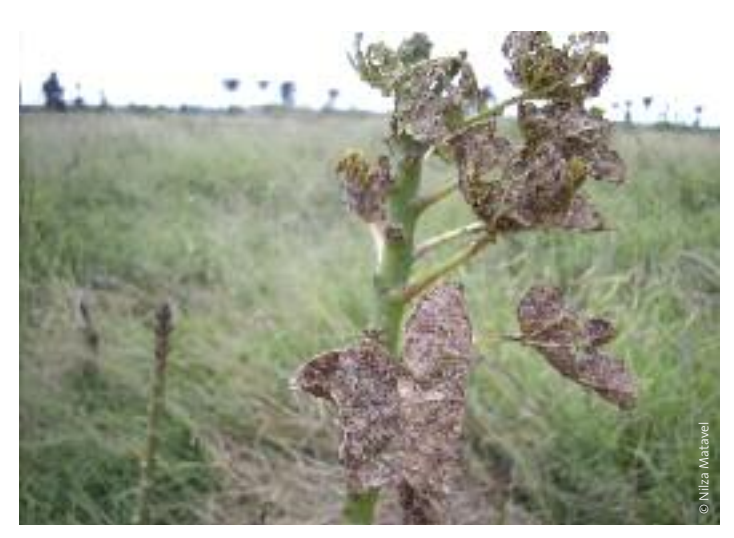
Jatropha with pests, Moamba district in Mozambique.

Farmers from the União Nacional de Camponeses (UNAC) in Mozambique who have been growing jatropha report slow growth rates, low yields and problems with pests<sup>89</sup>.