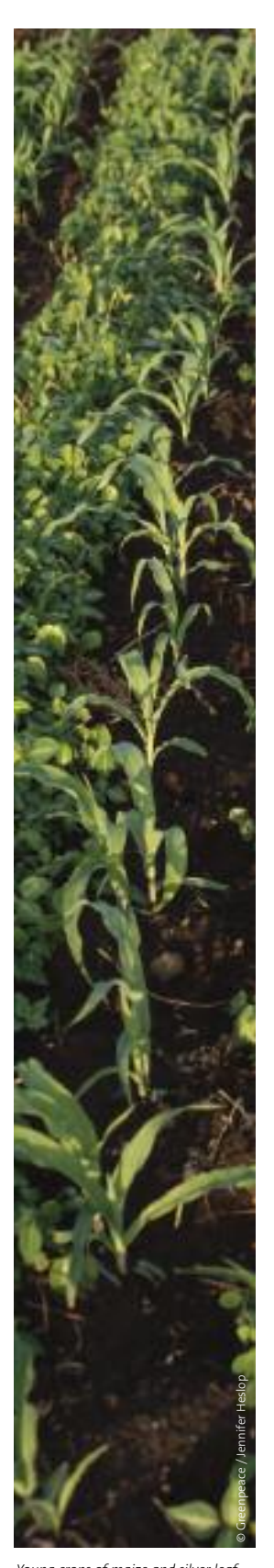
Young crops of maize and silver leaf, Suba District, Kenya.

Protection of farm workers: Agricultural waged workers should be provided with adequate protection and their fundamental human and labour rights should be stipulated in legislation and enforced in practice, consistent with the applicable ILO instruments. Increasing protection would contribute to enhancing their ability and that of their families to procure access to sufficient and adequate food.