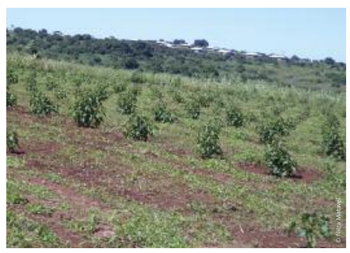
MoçamGalp plantation in Mozambique.

The Intergovernmental Panel on Climate Change has predicted that parts of Africa are likely to become drier, with less reliable rainfall as a result of climate change. The area of African land classified as "dry" could increase by up to 90 million ha. The lack of water will affect crop yields and make livestock farming impossible in some areas<sup>109</sup>.