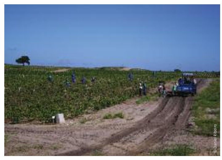
Energem laborers, Dzeve community, Bilene District in Mozambique.

In some cases, foreign companies are reported to be abusing local laws intended to protect workers rights. Sun Biofuels, also in Mozambique, employs 430 workers on jatropha plantations, with workers reportedly employed to work a 45 hour week, with longer days than the law permits<sup>86</sup>.