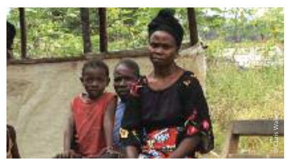
Congolese villagers living near M'Boundi.

In Tanzania, thousands of rice and maize farmers were forced off their land in 2009 or have been threatened with eviction to make way for sugarcane plantations in several parts of the country. More than 1,000 rice farmers had to leave their land on the Usangu plains in 2009, leading to widespread disputes. A similar number faced eviction from the Wami Basin to make way for a planned plantation<sup>58</sup>. European companies, backed by the EU Energy Initiative and UK and US aid money are behind a number of the developments<sup>59</sup>. Jatropha and sunflower plantations have also been proposed. Protests from the farmers have led the Tanzanian government to rethink its approach to agrofuels<sup>60</sup>.