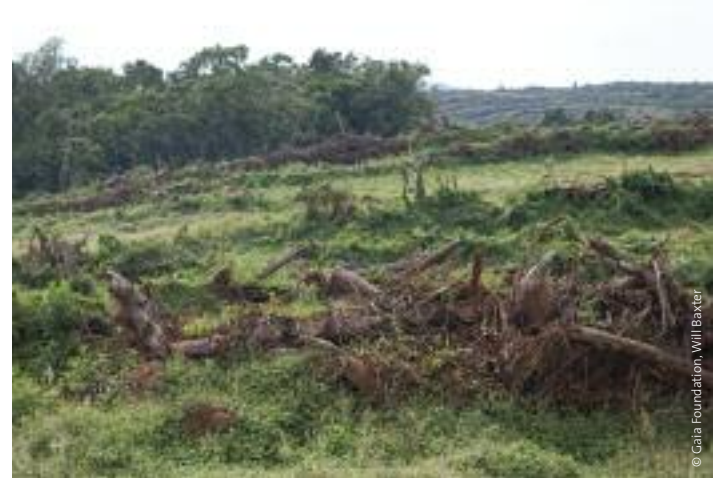
Land cleared for palm oil plantations in Kalangala Islands, Lake Victoria, Uganda

A comprehensive list of examples of land grabs for agrofuels is found in the appendix.