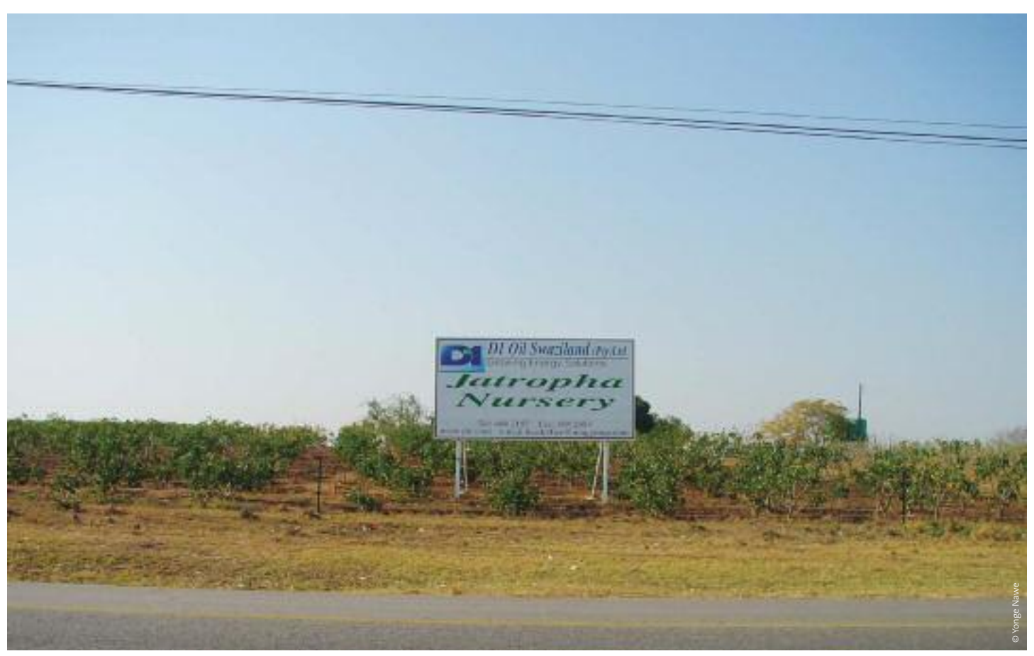
D1 Oils plantation in Swaziland.