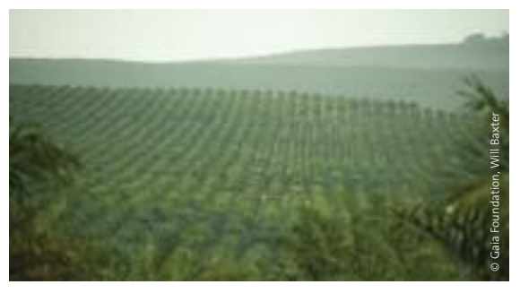
Palm oil plantations in Kalangala Islands, Lake Victoria, Uganda

In doing so, it draws on a number of studies, press reports and local research. There is however a lack of detailed public information about land deals and ownership in most parts of Africa and providing a full picture of the situation is close to impossible. The political situation in a number of Africa countries also makes it very difficult for civil society and members of the public to obtain official information or to speak openly. This report is therefore only a snapshot based on what information is publicly available. Increased transparency and more research are urgently required.