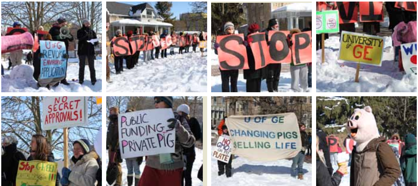
A cold February day can't stop Canadians! The banner pictured here is a spoof on the official slogan “University of Guelph: Changing Lives, Improving Life.” The Big Carrot in Toronto hired a bus to help urban consumers join farmers and students at the protest!