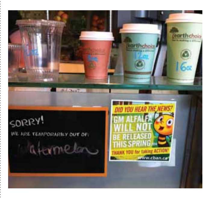
The Big Carrot's juice bar shares the news of campaign success with customers! (Toronto)

of federal regulation. He said: "the applicants raised several valid issues that clearly fall outside the scope of the narrow federal safety assessment. Issues related to sustainable and organic agriculture, increased herbicide use, and related social and economic effects play no role in the federal approval process for GE crops."