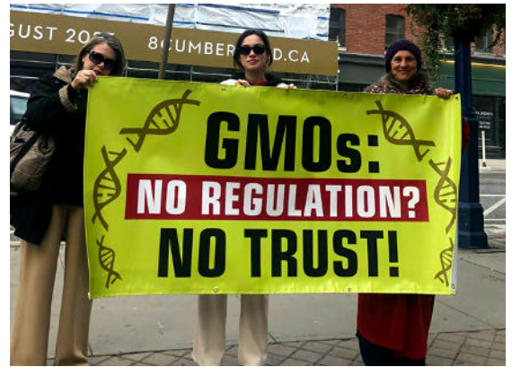
Protesters greeted the start of the industry “Public Trust Summit” October 25, 2022, Toronto.

In 2022, we continued our critical campaign to stop the government from removing regulation of many new genetically engineered foods and crops. We also contributed research on other important issues, which was used around the world.