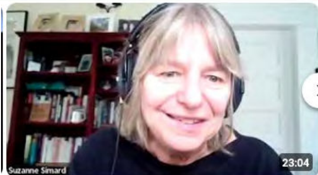
Dr. Suzanne Simard at CBAN's "LeafyReads" book club event